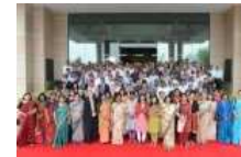
UN Familiarisation Programme conducted at India's National Audit Office, New Delhi (20-25 March)